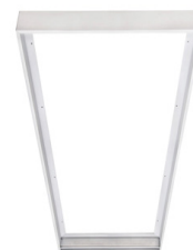
SURFACE MOUNT KIT LBSM14