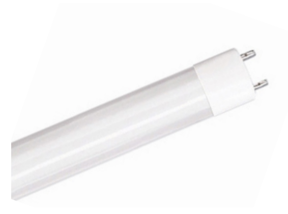
LLR145 STANDARD • 5YR LED DIRECT INSTALL LINEAR T8 REPLACEMENT LAMPS (PLUG AND PLAY) (UL TYPE A)