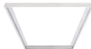
SURFACE MOUNT KIT LBSM22