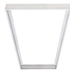
SURFACE MOUNT KIT LBSM24